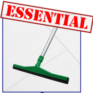
Foam Rubber Squeegee