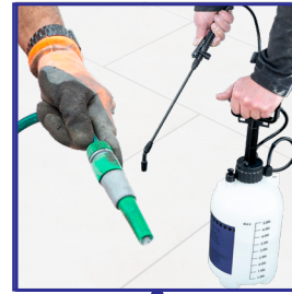
Fine Mist Hose / Hand Sprayer