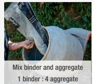
Mix binder and aggregate 1 binder : 4 aggregate