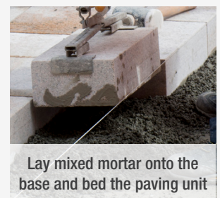
Lay mixed mortar onto the base and bed the paving unit