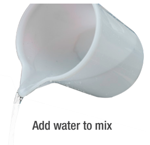
Add water to mix