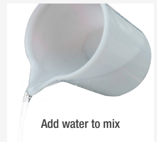
Add water to mix