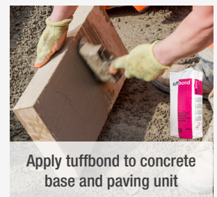
Apply tuffbond to concrete base and paving unit