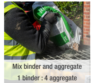
Mix binder and aggregate 1 binder : 4 aggregate