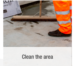
Clean the area