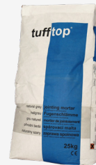
tufftop - natural grey jointing mortar

Steintec ® high performance paving mortars