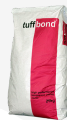
tuffbond priming mortar

tuffbed 2-pack bedding mortar mixed with tuffgrit (1x tuffbed 2-pack : 4x tuffgrit)