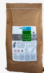
tuffflow - dark grey bound permeable jointing mortar

Steintec ® high performance paving mortars