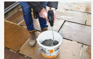
Add 1 L of water, then 1 sachet and mix.