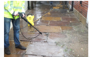
Remove organic material and loose jointing. Jet wash clean.

Do NOT let mortar dry on the surface, spray with a light mist to keep moist while applying and cleaning, if necessary.