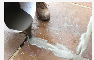
Pour mortar onto wet paving