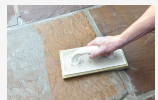
Clean using a squeegee or sponge float