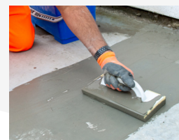
Brush apply tuffbond to the base* and to the underside of the paving units