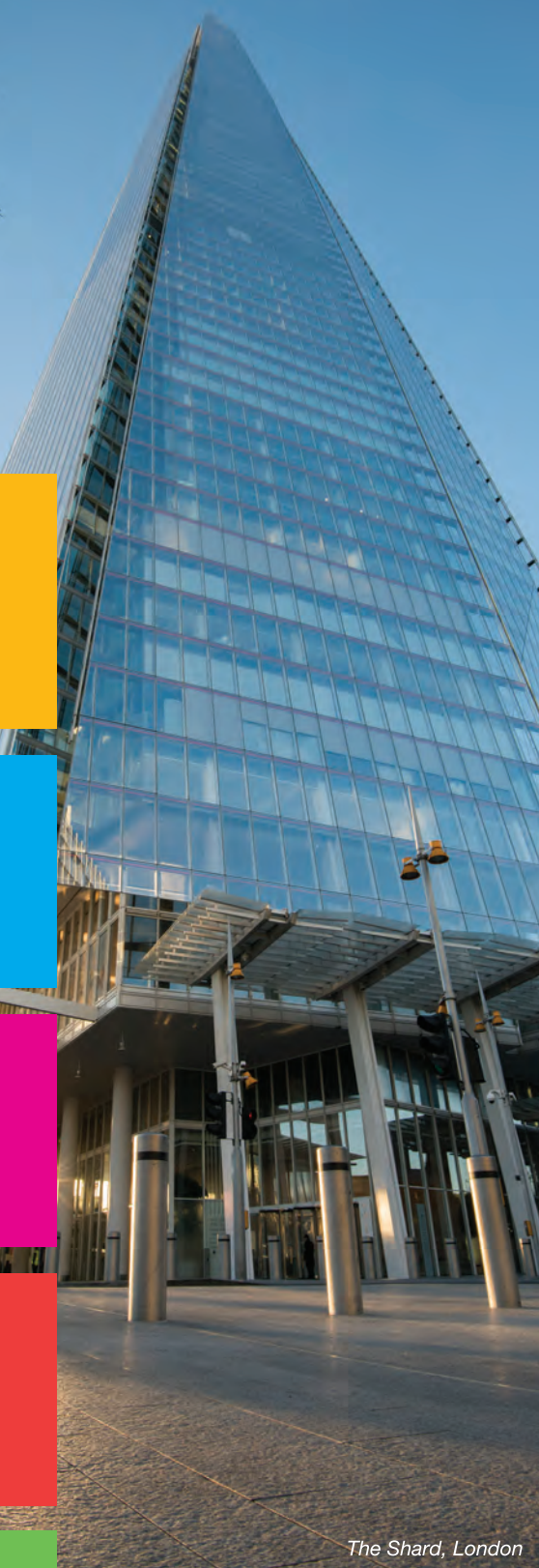
The Shard, London