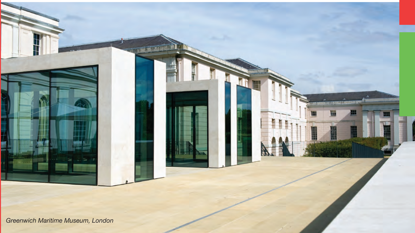
Greenwich Maritime Museum, London

Carefully tested paving products and specifications for public realm and streetscape projects ensure jobs meet essential performance criteria, including a long life and cost-effective maintenance. We recognise the importance of ensuring jobs are cost-effective and are environmentally sustainable.