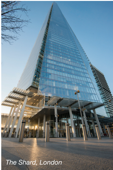
The Shard, London