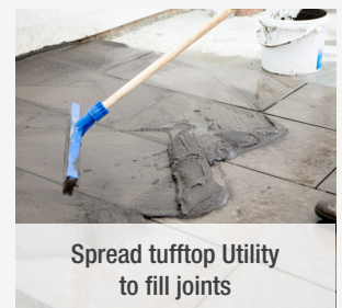
Spread tufftop Utility to fill joints