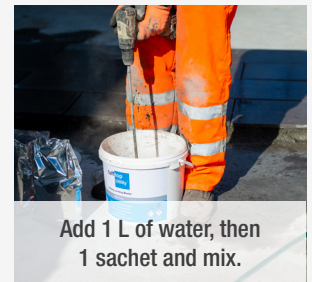
Add 1 L of water, then 1 sachet and mix.