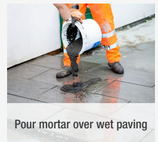
Pour mortar over wet paving